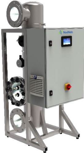
NoviNato OXY-3 system

The NoviNato OXY-3 product series is an industrial water treatment system for water disinfection and chloramine reduction in public swimming pools.